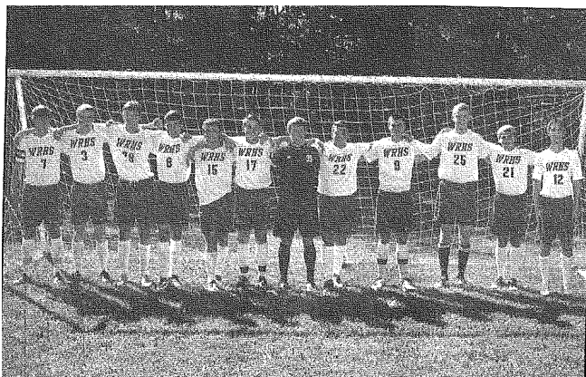
SENIORS RULE Seniors from the 2013 Boy's Soccer team pose for a group photo for the last time. The team will be losing twelve players next year.